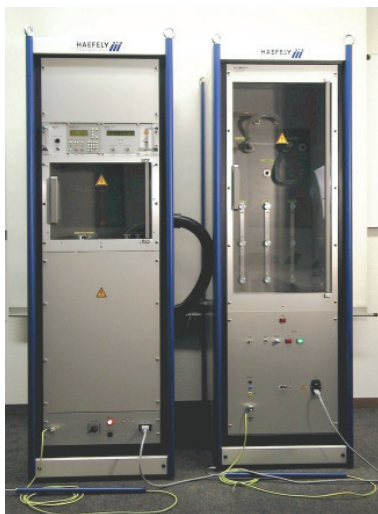
PSURGE 30.2 generator rack (left) with FPSURGE 3010 coupling network (right)

An integrated test cabinet provides optimal and safe connections for component testing.