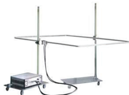
MAG 100 current transformer, 2mx2.6m antenna mounted on two support stands