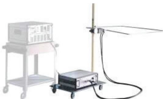
MAG 100 current transformer, 1mx1m antenna mounted on support stand (right) shown with the power source (left)

All EN product standards and many other applications.